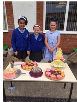
Girls in Y3 and Y4 held cake sales to raise funds for school

We are very proud of our young citizens for showing care and consideration for others - our heroes!