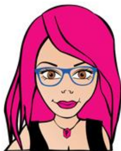
PARTY WITH PINKY

Or check the website www.habsfamily.co.uk/