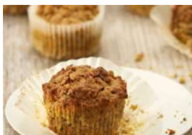
Carrot and courgette muffins