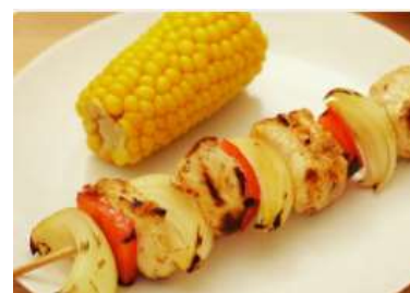
Jerk style chicken skewers