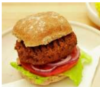
Chilli beef and beanburgers